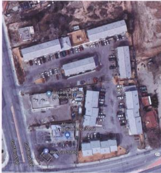
Apartment complex located at 1612 Goff.

At approximately 12:50 a.m., on July 25, 2017, Charles Chavez, broke into two vehicles that were parked at an apartment complex located at 1612 Goff, in Albuquerque, New Mexico. An auto theft alarm activated when Chavez entered the second vehicle. The apartment complex consisted of seven separate two-story buildings with apartments on the first and second floors.