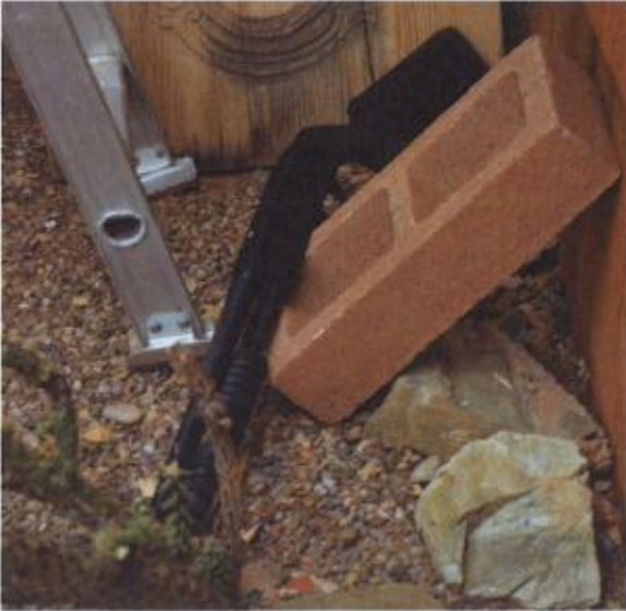
shotgun at scene